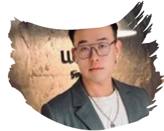
Ma Xin Exco