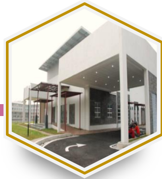
Engineering and Architecture Library