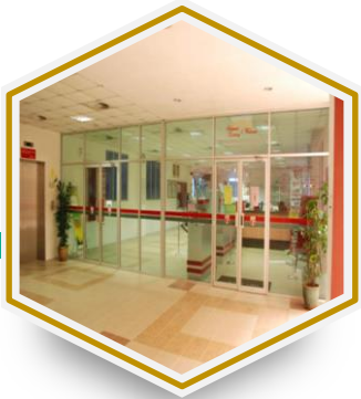
Medicine and Health Sciences Library