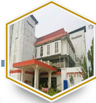
Bintulu Sarawak Campus Library