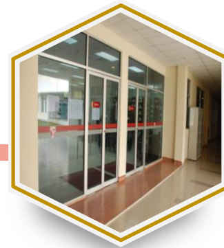
Veterinary Medicine Library